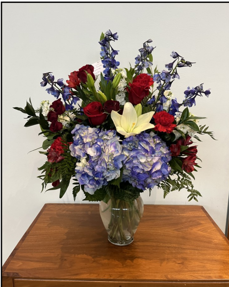
With Deepest Sympathy McLean County Spudway