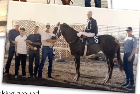
The Long Straightaway

To the ones who worked the breaking ground, Beneath the sun, through wind and rain, Who loved the thunder of the racetrack crowd And never feared hard work or strain.