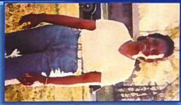
PALL BEARERS Family/Friends