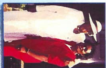
FLOWER BEARERS Family/Friends