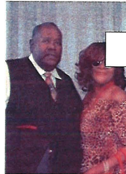
The 4 Horsemen