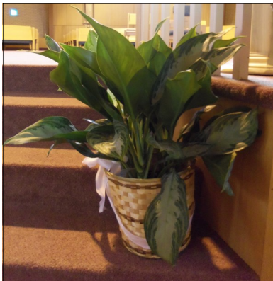
With Deepest Sympathy From, Residents & Staff At Mapleview