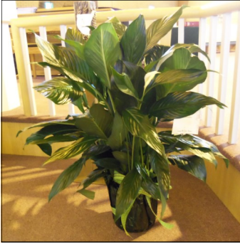
With Sympathy SRT Communications