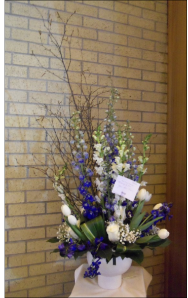
Thinking of you, Your Blue Team