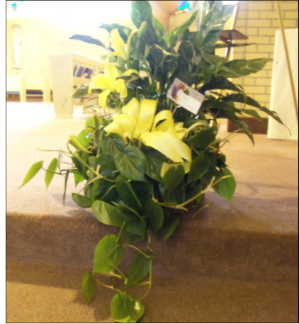
With Deepest Sympathy,