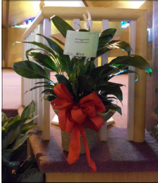
With Deepest Sympathy From, Trinity Therapy Services