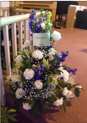
Our Heartfelt Condolences to your family. Keeping you in our prayers. Senator John and Mikey Hoeven