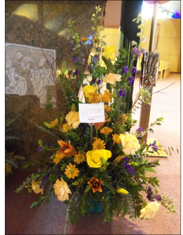
Our thoughts and prayers are with you and your family. Your friends at Bakemark