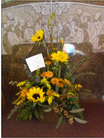
Fargo City Commissioners