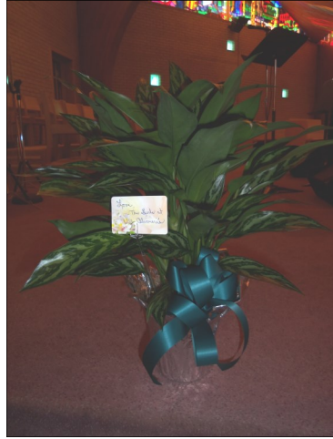
Love, The Girls at Olivieri's