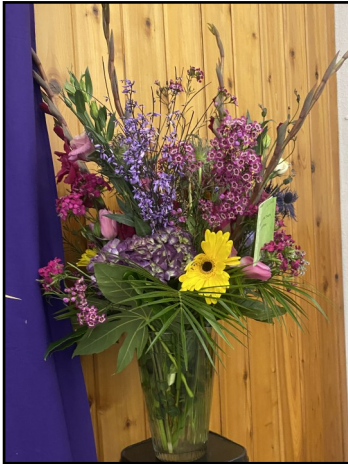
With Loving and Caring Thoughts The Youngs Family