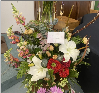
WITH DEEPEST SYMPATHY JON AND JODI