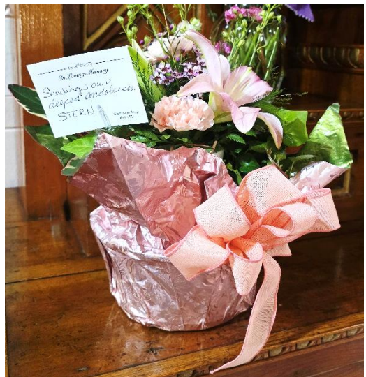
Sending our deepest condolences. STERN