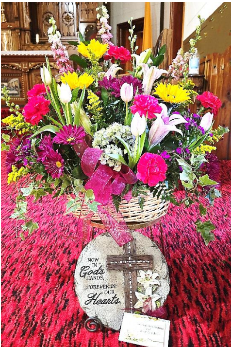
From all the Grandkids & Great-Grandkids