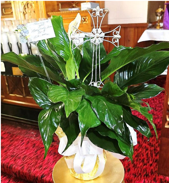
Thinking of you. Everybody from B-Y Electric