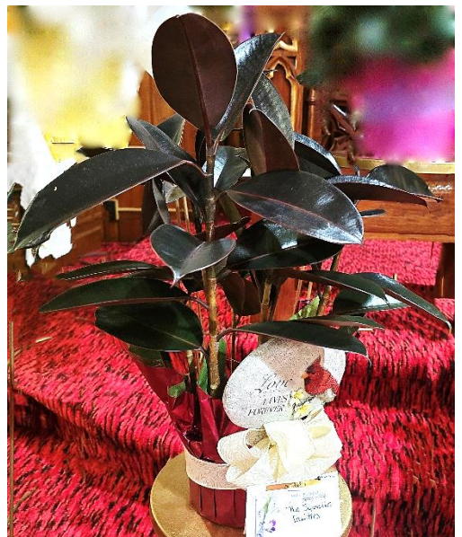
The Syrovatka Families