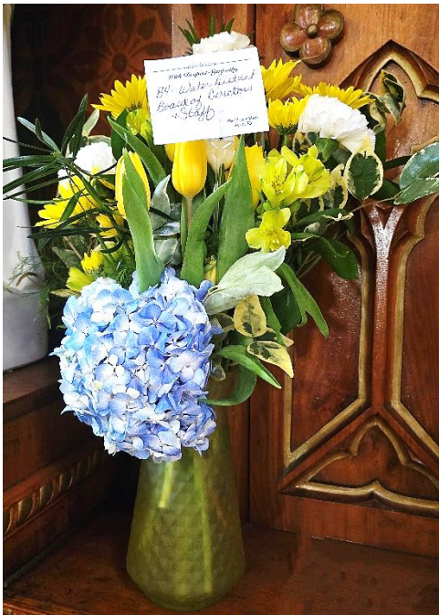
BY Water District Board of Directors & Staff