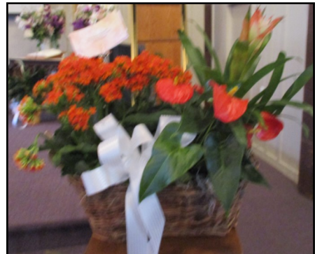
With Deepest Sympathy On The Loss Of Your Mother Your FSA Family