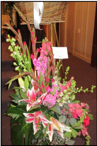
With Deepest Sympathy Thinking of you Schoek's Safe and Service Lock Flowers Box