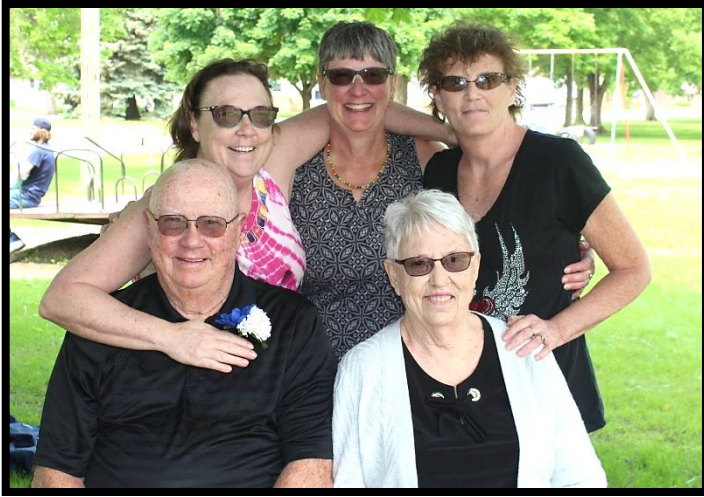
60 th Wedding Anniversary June 1, 2019