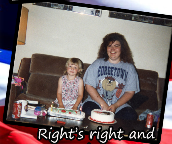
Right's right and wrong's wrong.