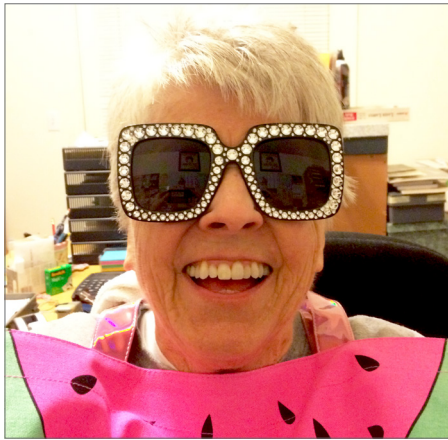
MEE's favorite Melon disguise