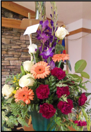
Our thoughts & prayers are with you from your friends at Oracle