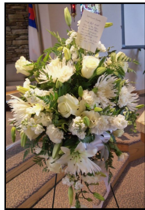
May God hold you in the palm of his hand. Our love & prayers are with you & your family. At the 457th TC BN HHD & 644 the TSG.