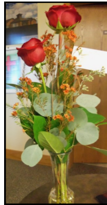
With Deepest Sympathy Members of Gamma Chapter of the Delta Kappa Gamma Society International