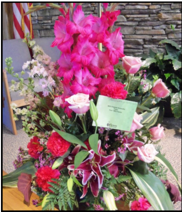
With Deepest Sympathy From, Your NES Family