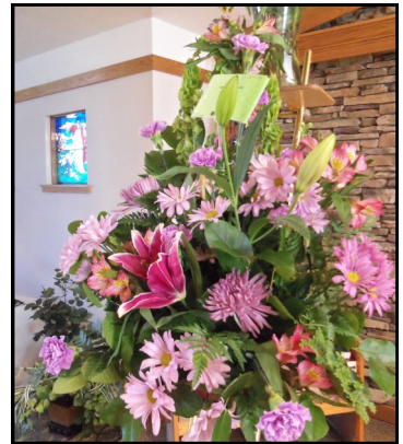
With Deepest Sympathy From, Howard Law Firm