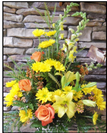
With Sympathy Atwood Family