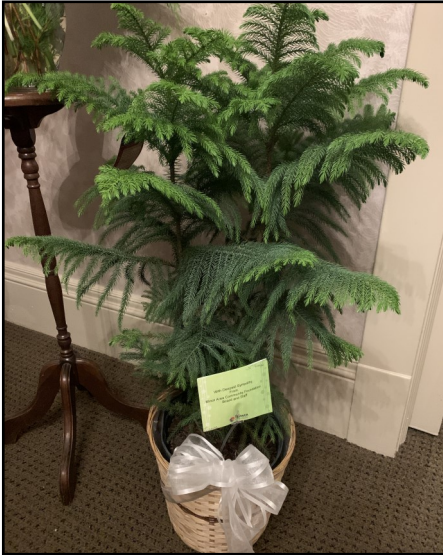
With Deepest Sympathy. From, Minot Area Community Foundation Board and Staff