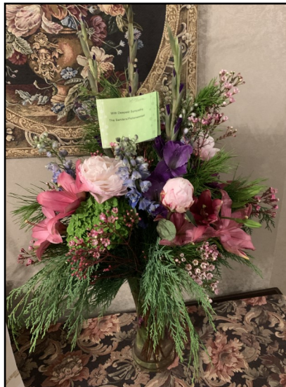
With Deepest Sympathy The Sanders/Pellenwessel