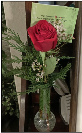
With Deepest Sympathy From the team at CaringEdge Hospice