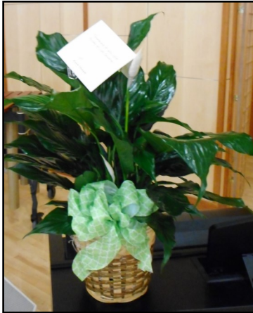
Thinking of you Love River of Life Church