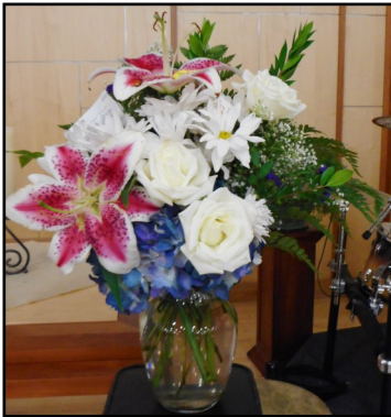
With Deepest Sympathy SRT Directors and Staff