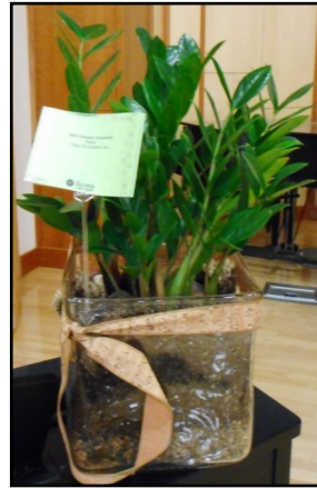
With Deepest Sympathy From, Town & Country Ins.