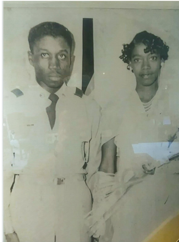
The two are now back together again!