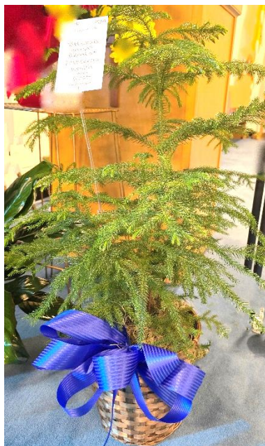
Todd Woods and your friends at First Dakota Wealth and Trust