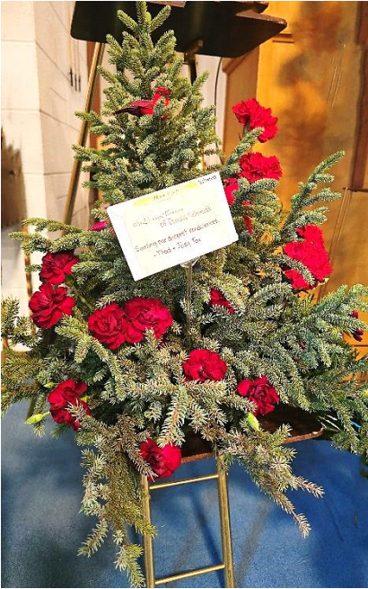
Sending our deepest condolences. Thad & Jody Fox