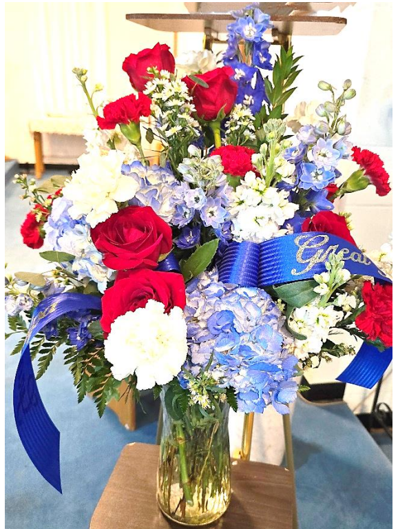
Grandpa ~ Great Grandpa