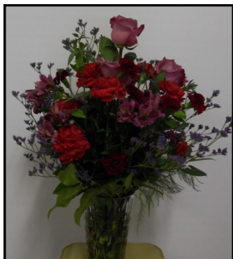
With deepest sympathy. From, The Staff and Management of Lowe's Floral and Garden Center