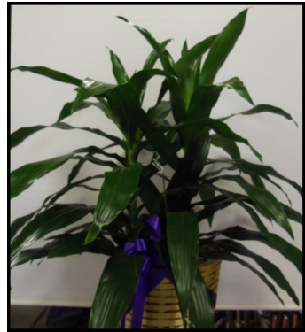
With Sympathy From the Directors, Officers, and Staff of First National Bank