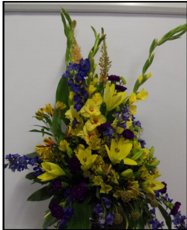
With Deepest Syathy, Souris Valley Suites