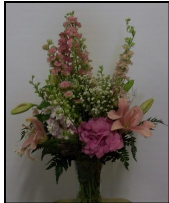
With Deepest Sympathy From The Deadwood Pinks