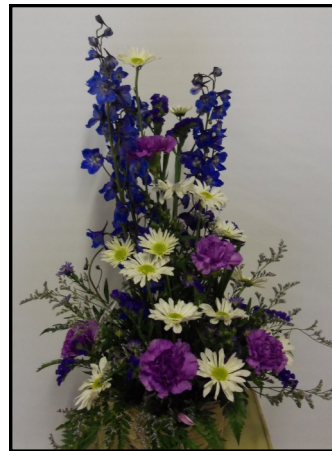
In Loving Memory, Sorry for your loss Campbell County Treasurer's Office