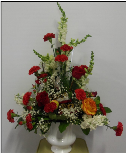
Love Mom and Dad