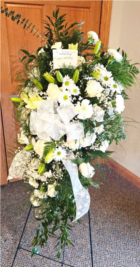
Everyone at GMG