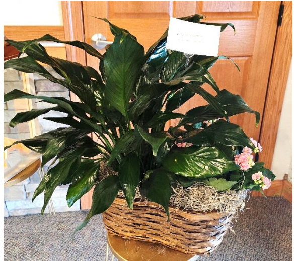
City of Vermillion