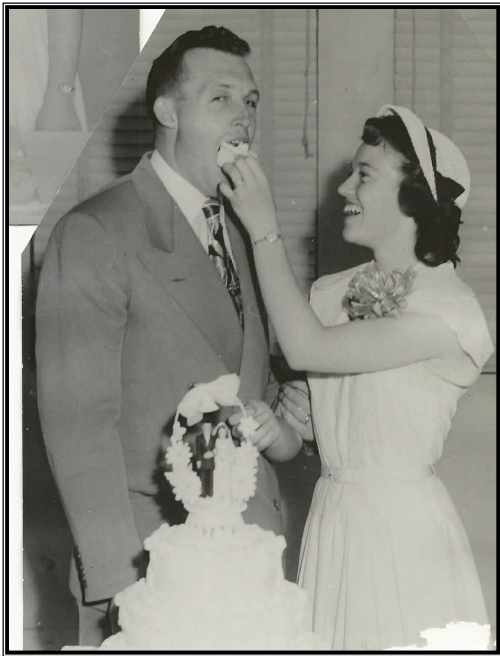
Married June 3, 1950