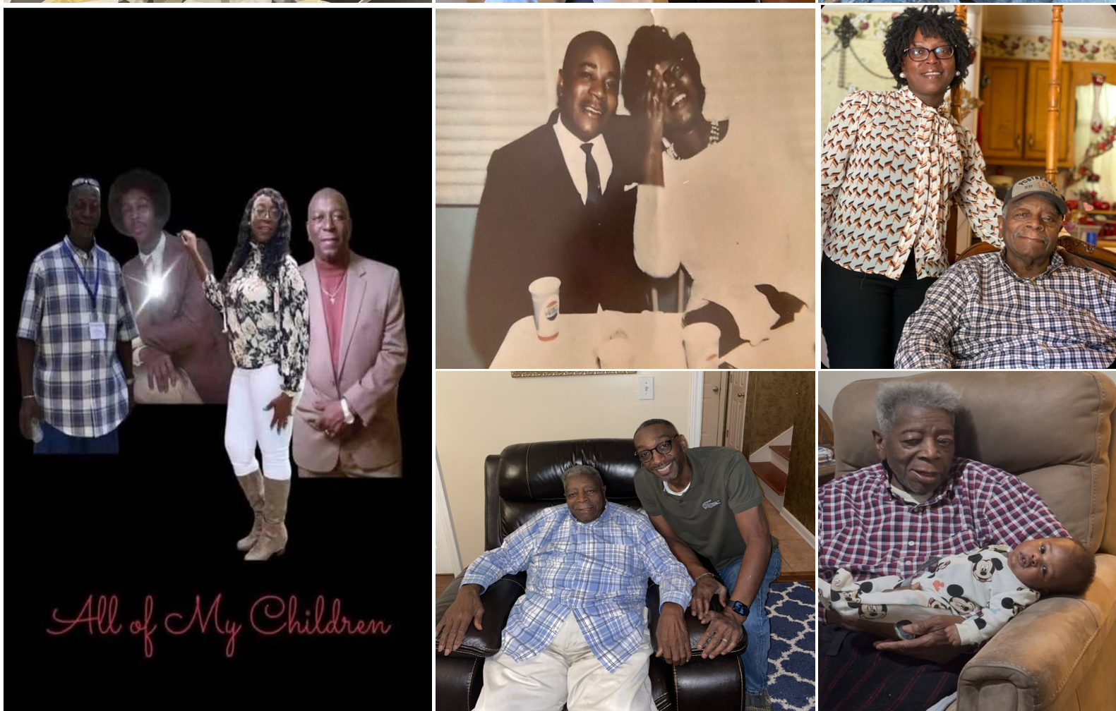
All of My Children