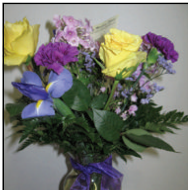
Kenmare Church of the Nazarene