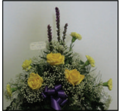
Minot First Church Of The Nazarene