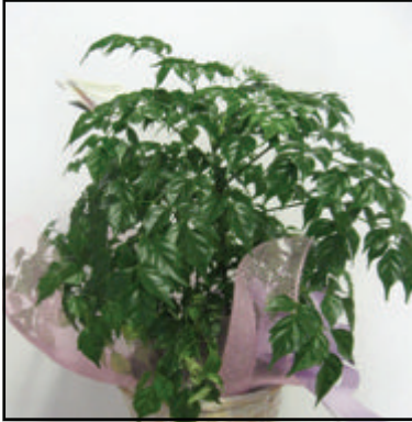
Williston Church Of The Nazarene