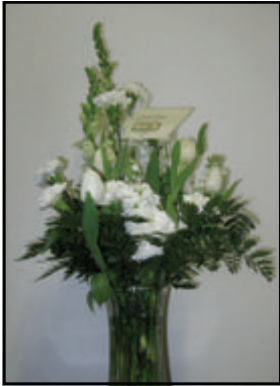
The Staff of ENERBASE Cooperative Resources