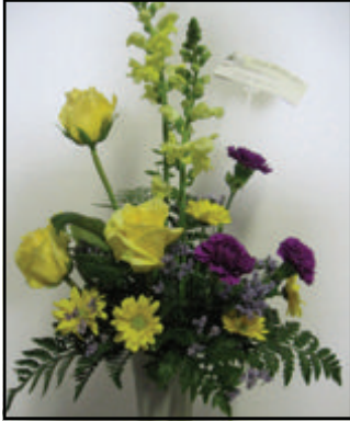
Eureka Township Board