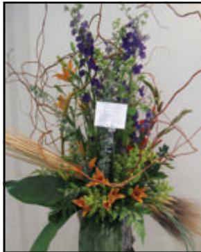
SRT IT & IS Departments